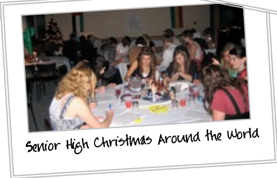
Senior High Christmas Around the World