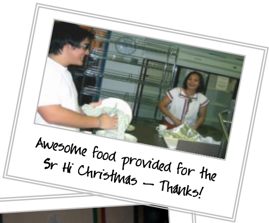
Awesome food provided for the Sr Hi Christmas — Thanks!