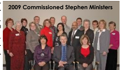
2009 Commissioned Stephen Ministers