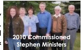
2010 Commissioned Stephen Ministers

Throughout the summer 11 of our 13 Stephen Ministers continued to meet on a scaled back schedule with their 'care-receivers' (the men & women whom they are individually encouraging & supporting). Our Stephen Leader Team is encouraged by the growing confidence Emmanuel members are placing in this ministry. One 'confidence indicator' is individuals taking initiative, asking to have a Stephen Minister. Such responsiveness has caught up with our current capacity; two women have had to be placed on our 'waiting list'. This need for more Stephen Ministers solidified the Leader Team's resolve to offer what will be our 3 rd training session. Last week a decision was made to schedule this 50 hour course starting January 2011. If you or someone you know might be interested, talk to any of our Stephen Ministers or Stephen Leaders.